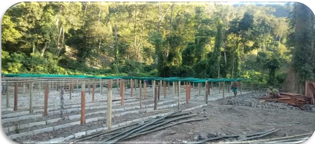
Eastern Central Nursery: Nanglam, Pemagatshel