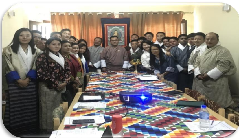
Khadar Session for new staffs

76% of our total staffs are working in various plantation and nursery sites while 24% of us work in the head office in Thimphu.