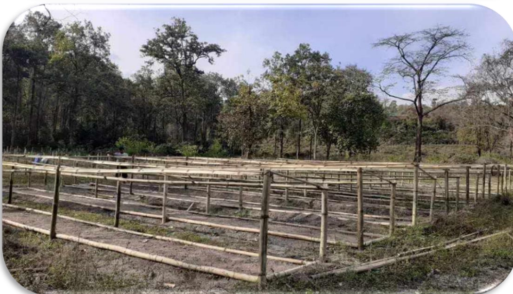
Southern Central Nursery: Naharani Sarpang