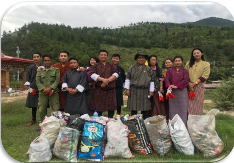
Olakha Children Park

GBCL observe the zero waste day every month by targeting areas which are in need of immediate cleaning. Apart from the office surrounding, GBCL has conducted cleaning campaign around, Olakha Children Park, and Semtokha Dzong area.