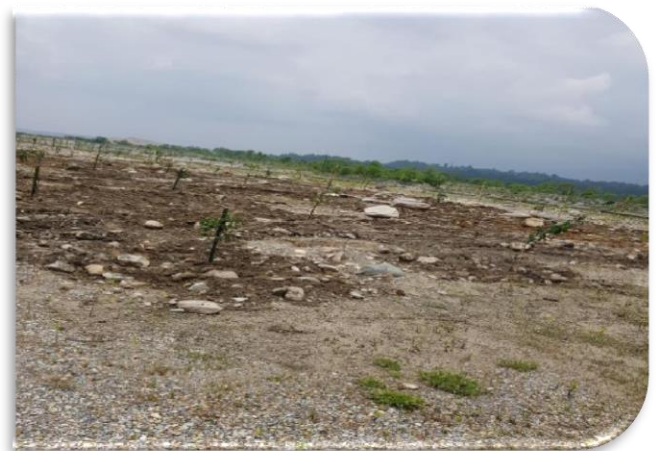
Landscaping work in progress at Damdum, Samtse