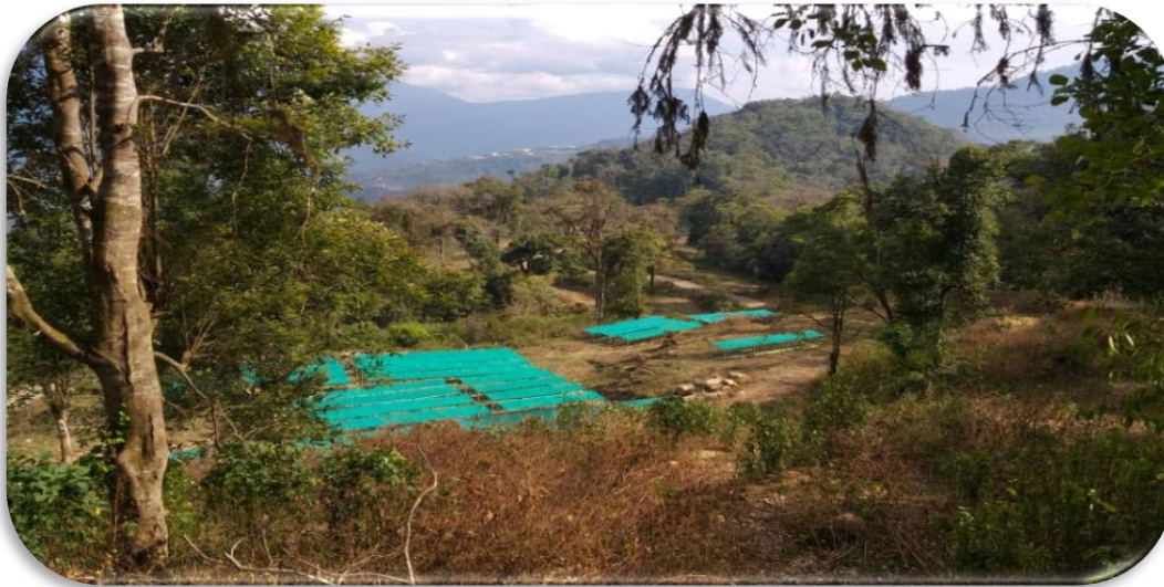
Western Central Nursery: Gedu, Chhukha